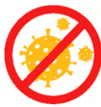
99.9% Kill Rate